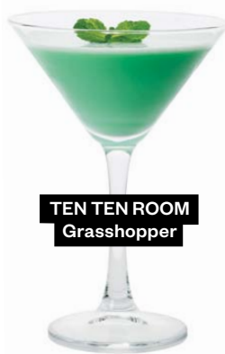
TEN TEN ROOM Grasshopper