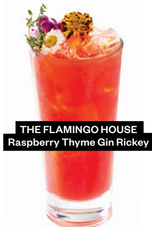
THE FLAMINGO HOUSE Raspberry Thyme Gin Rickey