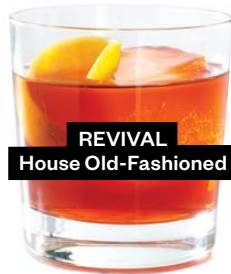
REVIVAL House Old-Fashioned