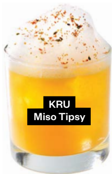
KRU Miso Tippy