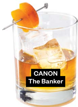
CANON The Banker