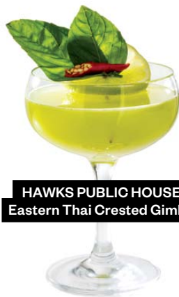
HAWKS PUBLIC HOUSE Eastern Thai Crested Gimlet